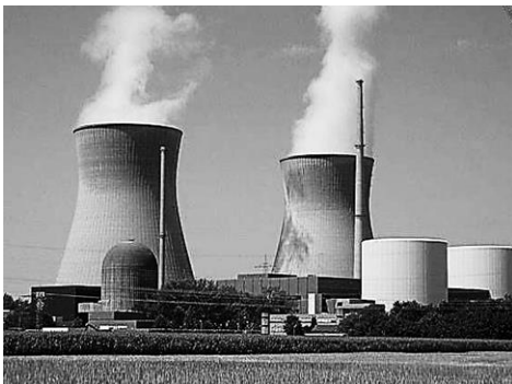
Kakrapar Atomic Power Station (PHWR)

A limited number of scholarships will be offered covering travel and living expenses